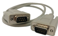
2x Cable serie